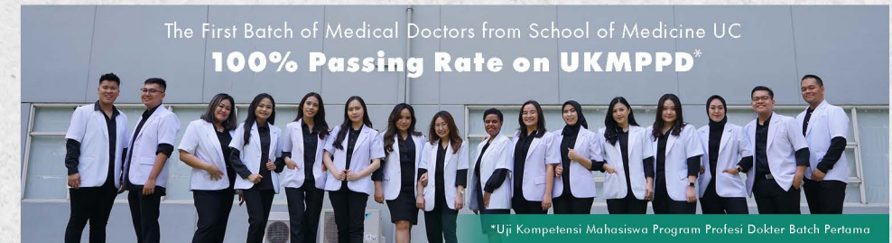
The First Batch of Medical Doctors from School of Medicine UC 100% Passing Rate on UKMPPD*

Studying in the Medical International (MED-IC) program at Universitas Ciputra has provided me with a highly satisfying learning experience. The comfortable academic environment and excellent facilities, such as advanced laboratories, greatly support our learning process. Especially the supportive lecturers who are always ready to help develop our curiosity and potential. This program also offers numerous opportunities and a double degree program, which strongly support the development of medical skills and open up broader career opportunities. With the learning process delivered in English, we have become more adept at communicating and building connections with lecturers and experts from abroad.